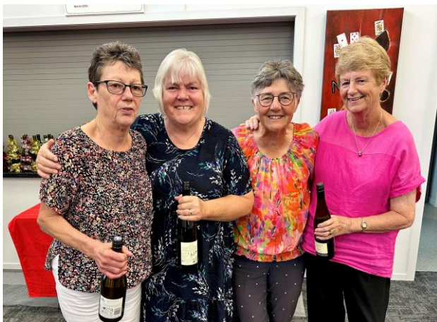
Winners of the Bridge session following the Christmas lunch.